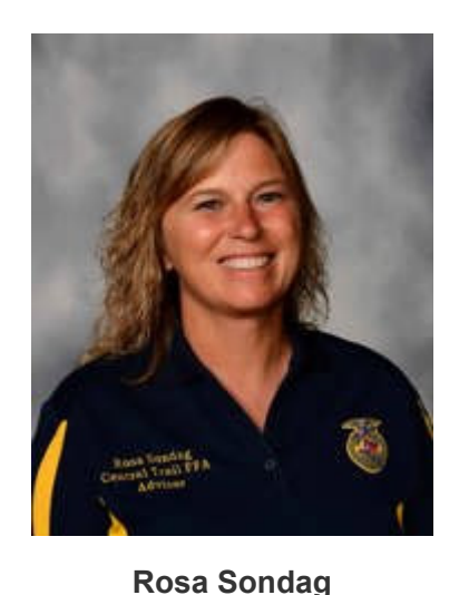
South Central District